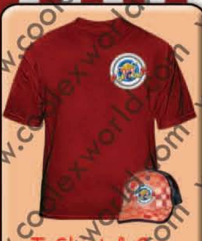
T-Shirt & Cap